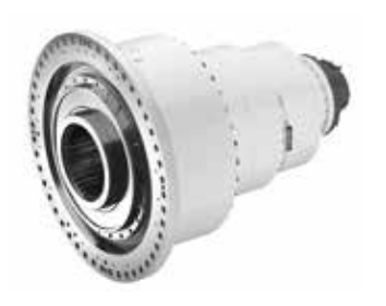
Micro tunnelling Central hollow shaft for suspension passage