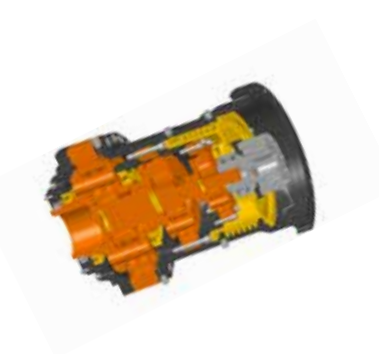
Service concepts Condition Monitoring Downtimes can be reduced with the predictive maintenance concepts for TBM qearboxes.

The Condition Monitoring System »ZMA« also makes it possible to continuously monitor the condition and to calculate the gearbox's remaining service life.